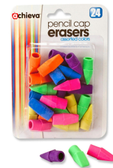
1 small pack cap erasers