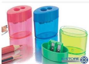
1 small pencil sharpener