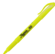
3 highlighters (3 different colors)